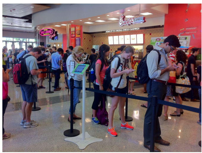
Figure 1: Public space at a college campus: information and space without interaction; Source: (Author 2005)

KEYWORDS: Responsive architecture, ICT (Information and Communication Technologies), HCI (Human Computer Interaction), Media