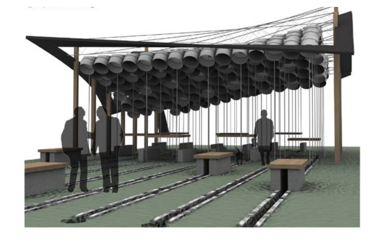
Figure 1- design for quilt of 55 gallon drums

Process-based form-making has become a normative method for the development of conceptual ideas in design. At a multitude of scales, architects define systemic parameters or networked linkages that value relational dynamics over traditional, linear notions of design. From SHoP Architect's material and construction systems-based methodology (Dunescape, Mulberry,