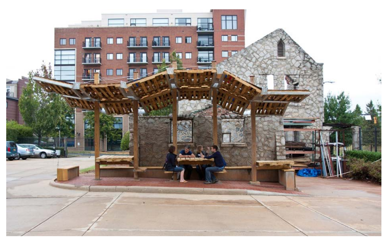
Figure 4- Final constructed canopy

models. Ottchen argues that the combination, overlap, integration, and variability of qualitative information can be analyzed and used through not only parametric algorithms but also through the inclusion of underlying and sometimes more difficult to perceive of information.